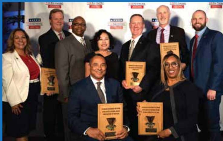
2019 VIB Above & Beyond Winners

EXPERIENCE the Veterans In Business Network National Conference in Sacramento, November 8-9, 2021. The VIB conference is being recognized as the premier Veteran business conference to attend. This year we are expecting over 400 attendees nationwide. The VIB conference offers innovative speakers and workshops, amazing networking throughout, an Opportunity Expo, a Veteran Business Marketplace Reception, the iconic Above & Beyond Awards Banquet Dinner and more!